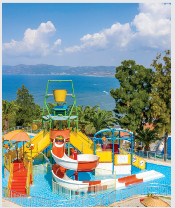
2 water slide pools are in the bungalowgarden area, one is for adults with three slides and the other for toddlers with a slide park.