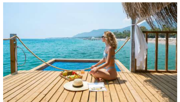
Pier & Beach Pavilions are available from the 1st of May